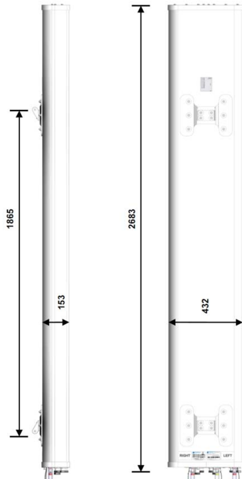
Dimensions (in mm)