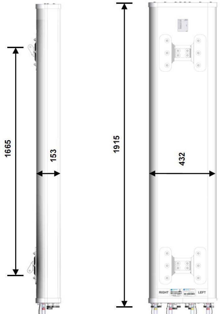
Dimensions (in mm)